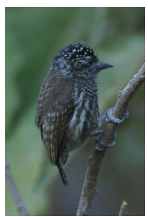
Tumbes Hummingbird and Ecuadorian Piculet, two Tumbesian Endemics well seen during the trip.

T Ecuadorian Trogon ( Trogon mesurus ). One female seen where we got lunch above the Limon Village on October 25<sup>th</sup>.