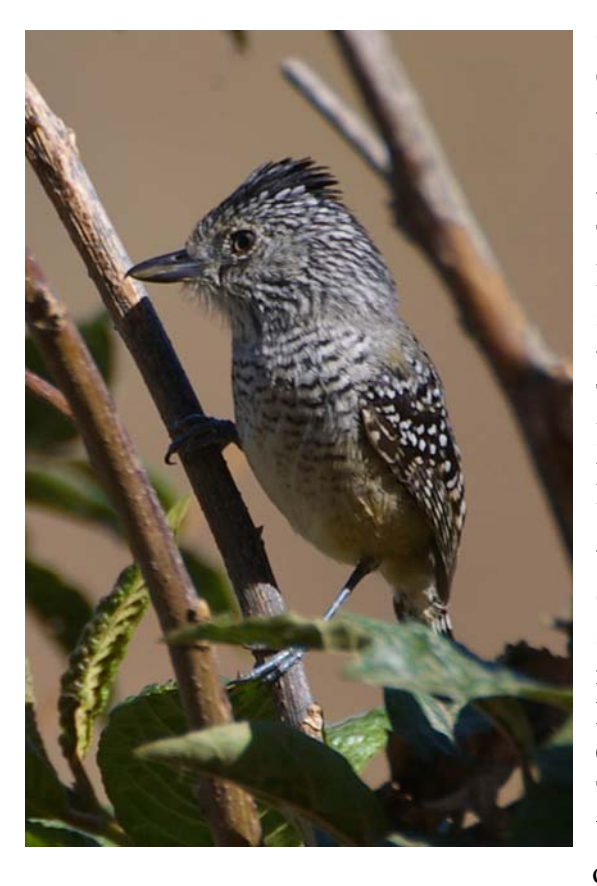
Chapman's Antshrike.

October 24<sup>th</sup>: We started the birding trip heading northeast of Chiclayo to Bosque de Pomac mesquite forests, where we spent the morning exploring the area. We easily found Pacific Parrotlet, Short-tailed Woodstar, Necklaced Spinetail, Collared Antshrike, Peruvian Plantcutter, Tumbesian Tyrannulet, Superciliated Wren, Cinereous Finch, White-edged Oriole and many other birds. Then we drove to a dryer area where we saw a group of at least 6 Tumbes Swallows. As midday approached, we drove towards Olmos, stopping briefly near Motupe for picking up Tumbes Sparrow and the handsome Tumbes Tyrant among other birds. In the afternoon we headed north of Olmos, where we added other Tumbesian endemics to our list. We then headed for dinner and overnight in El Remanso hotel, in Olmos town.