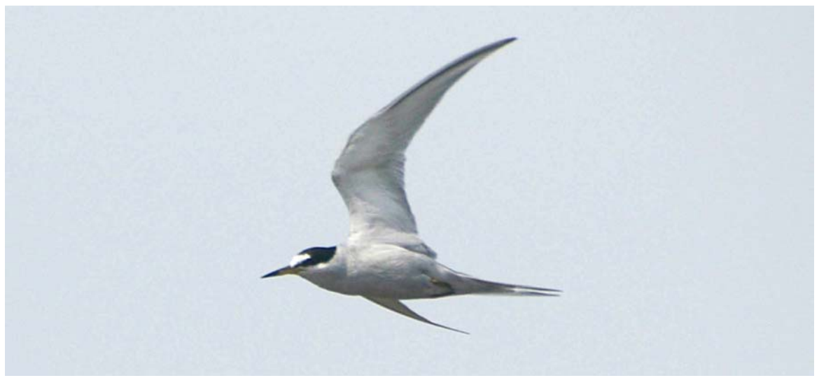
Peruvian Tern, one of the best birds of the trip!!!!!!.

T White-edged Oriole ( Icterus graceannae ). Several seen at Bosque de Pomac on the first day and in the next two days.