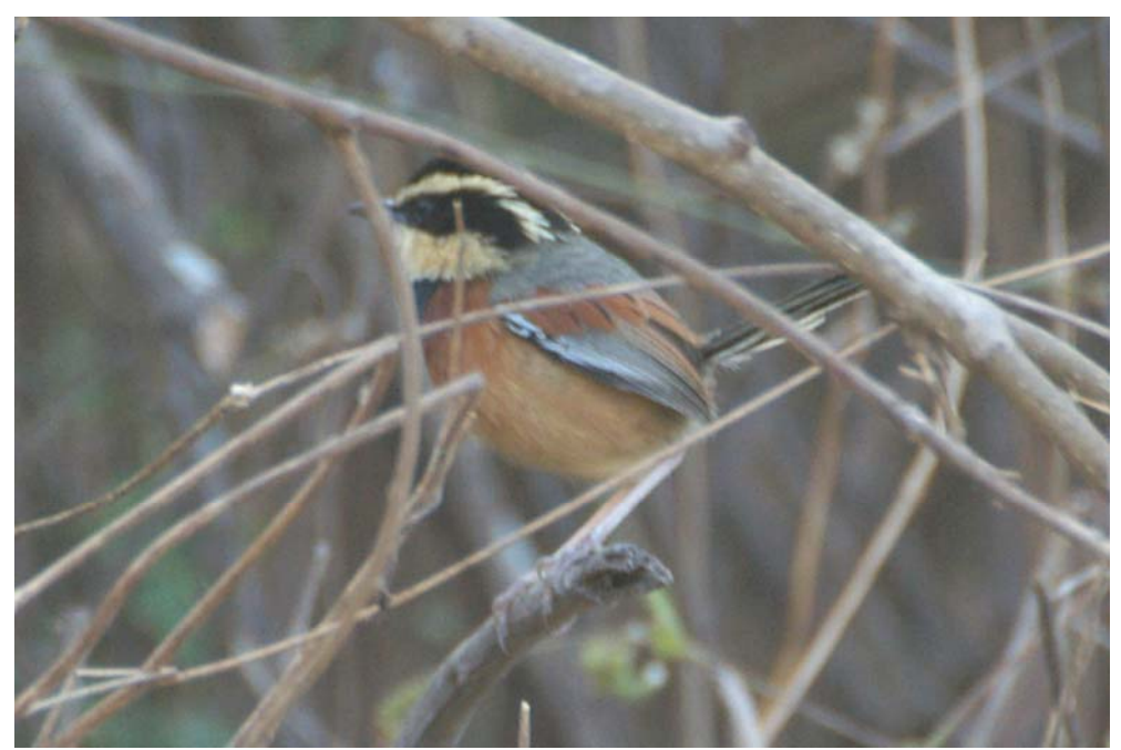
Elegant Crescent-chest.

E T Peruvian Plantcutter ( Phytotoma raimondii ). We saw several individuals of this bizarre bird in Pomac forests on the first day of the trip. For some considered in the Cotingas family and for some as a part of its own family (Phytotomidae). Later we found what results to be a new population of this endangered bird near Batan Grande. EN