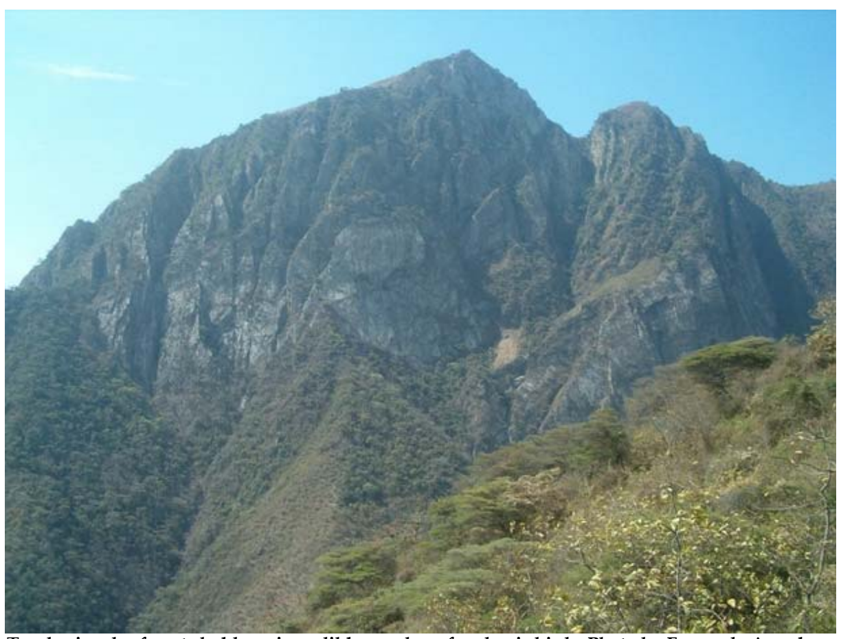
Tumbesian dry forests holds an incredible number of endemic birds.

24<sup>th</sup> - 28<sup>th</sup> October 2006